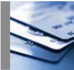
RS Software provides complex solutions in the area of clearing and settlement systems.

Solution: RS Software provides clearing and settlement solutions that handle large transactions in an environment marked by cross-border activity, regulatory changes and payment diversity.