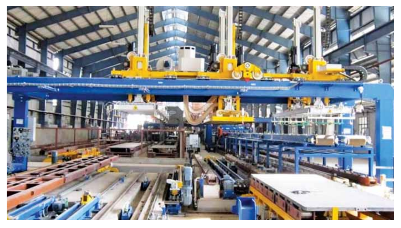
A view of Destacker at Kotputli Factory