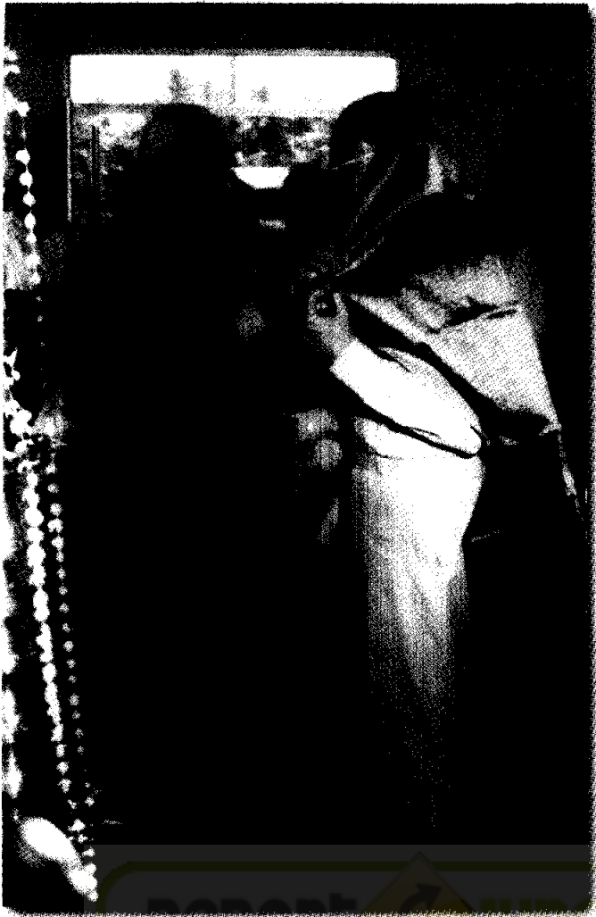
Prof. G.L. Peiris, Hon'ble Minister of Constitutional Affairs and Industrial Development and Deputy Minister of Finance and Planning, Govt. of Sri Lanka, being received by our Chairman, during the former's visit to our factory in Makandura, Sri Lanka.