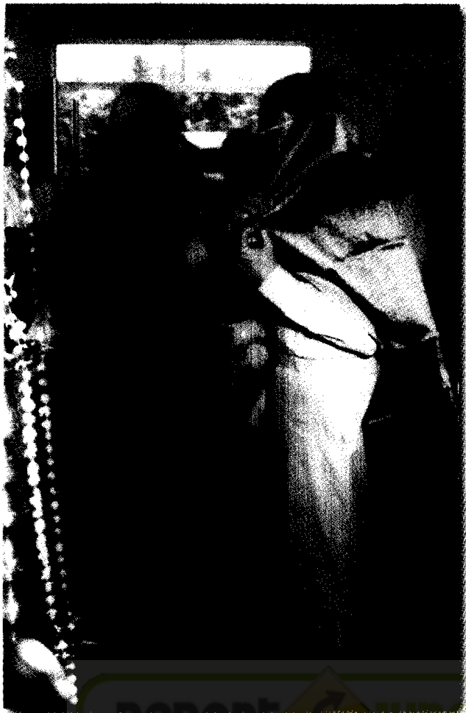
Prof. G.L. Peiris, Hon'ble Minister of Constitutional Affairs and Industrial Development and Deputy Minister of Finance and Planning, Govt. of Sri Lanka, being received by our Chairman, during the former's visit to our factory in Makandura, Sri Lanka.