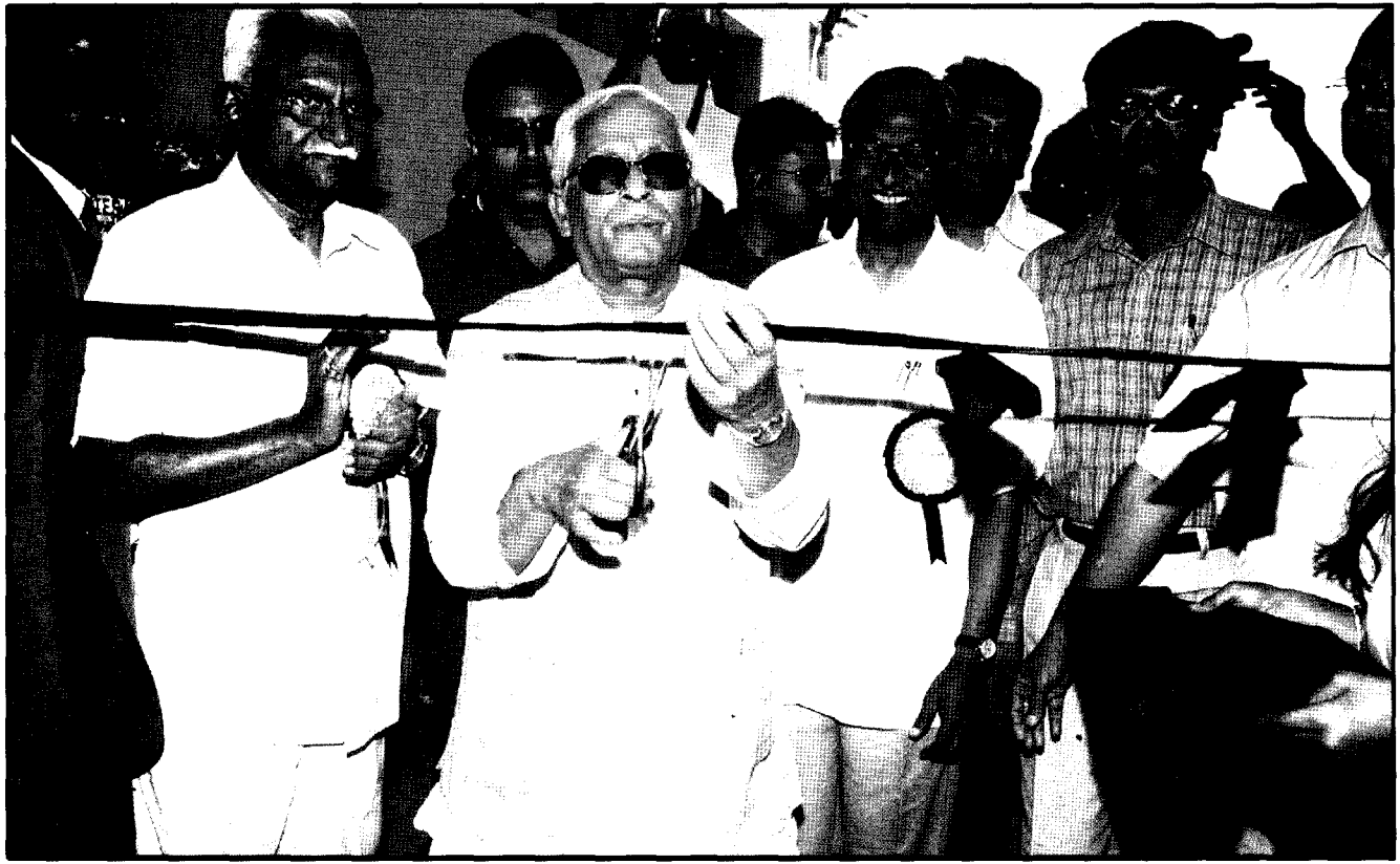
Photographs taken on the occasion of inauguration of Fibre Cement Sheet Plant and laying of the foundation stone for the Cement Clinker Grinding Project at Kharagpur, by Shri Buddhadeb Bhattacharjee, the Hon'ble Chief Minister of West Bengal, flanked by our Chairman and Shri Nirupam Sen, Hon'ble Minister for Industries and Commerce, Government of West Bengal.