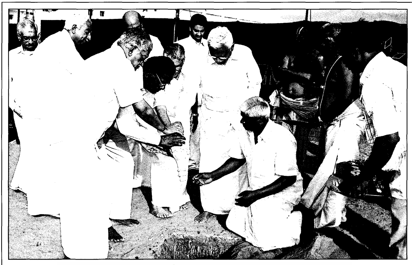
Our Chairman performing Bhoomi Puja at the site of our new Textile Mill at Rajapalayam