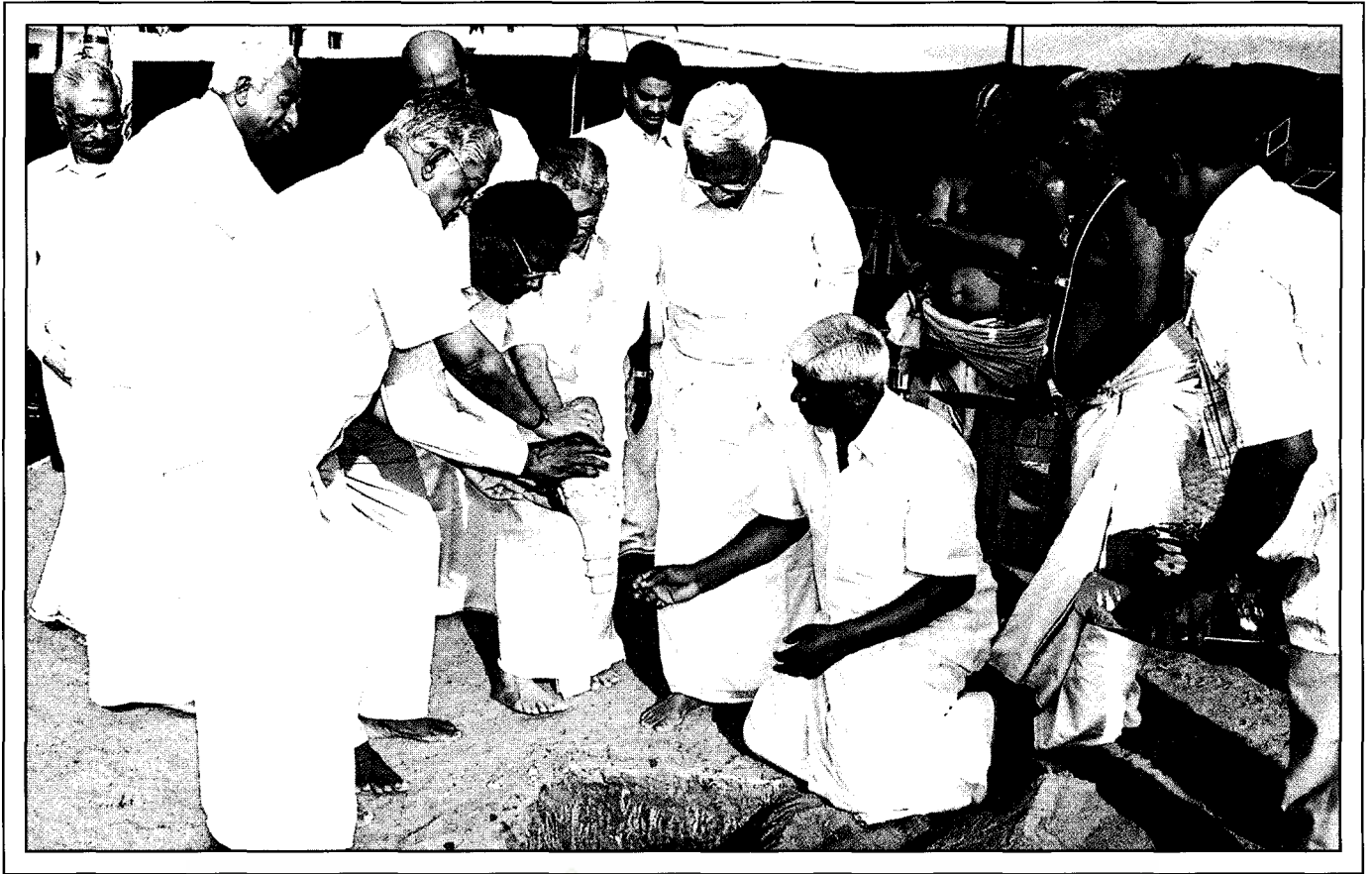
Our Chairman performing Bhoomi Puja at the site of our new Textile Mill at Rajapalayam