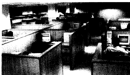
A section of our R & D center