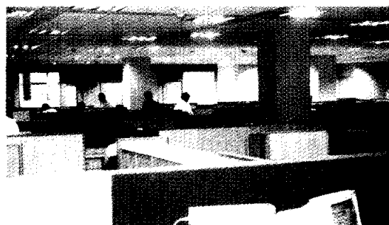
ODC - Offshore Development Center