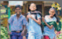
Business Responsibility Report / 104

On the cover: The cover depicts RIL’s commitment to the growth and progress of all stakeholders through consistent investments and innovations across the energy and consumer businesses. RIL has always partnered India’s all-round progress in line with its philosophy of ‘Growth is Life.’