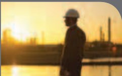
Management Review / 46