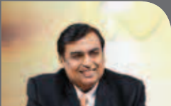
Letter from the Chairman / 04