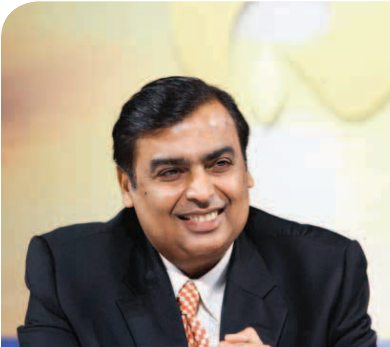
Mukesh D. Ambani, Chairman and Managing Director

I am delighted to write to you once again to update you on the performance of Reliance Industries Limited. Reliance continues to set new benchmarks and records despite a challenging global economic scenario marked by volatile commodity prices, weak growth in certain major economies and dollar appreciation against most major global currencies.