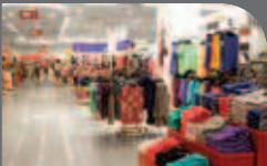
Review of Operations / 20