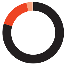
CSR Expenditure FY 2014-15 (₹ in crore)

RIL’s CSR initiatives help elevate the quality of life of millions. It seeks to touch and transform lives by promoting healthcare, education, rural wellbeing and employment opportunities. RIL aims to continue its efforts to build on its tradition of social responsibility to empower people and deepen its social engagements.