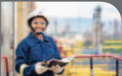
Invest, Innovate, Inspire / 10