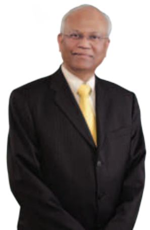
Dr. Raghunath A. Mashelkar Independent Director