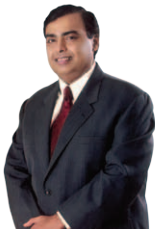
Shri Mukesh D. Ambani Chairman and Managing Director