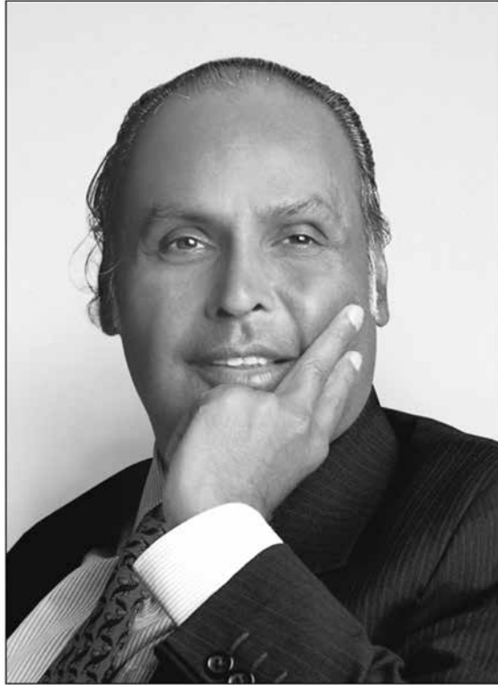
Padma Vibhushan Shri Dhirubhai H. Ambani (28th December, 1932 – 6th July, 2002) Reliance Group – Founder and Visionary