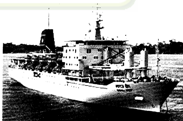
m.v. Swaraj Deep