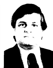
Shri Nasser Munjee