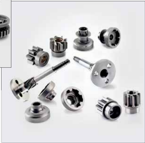
Starter Motor Components

We believe in the utmost safety and stability of our riders. In order to achieve that, we have introduced the state-of-the-art German Braking System using German Technology.