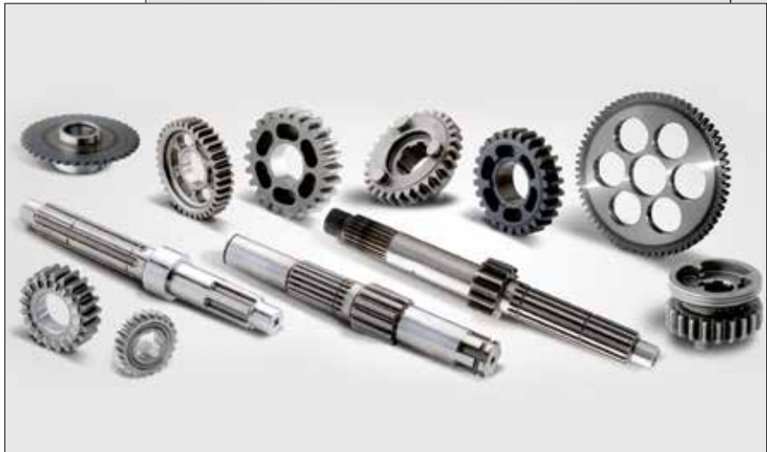
Transmission Gears & Shafts