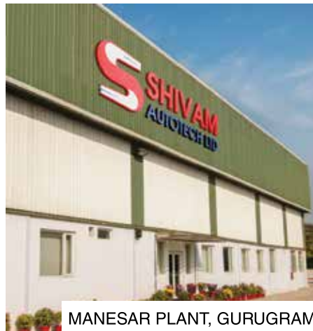
MANESAR PLANT, GURUGRAM