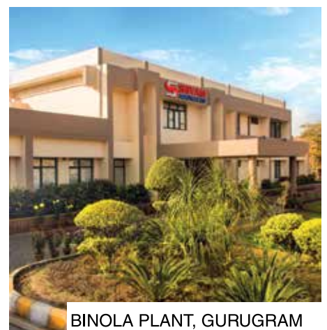
BINOLA PLANT, GURUGRAM