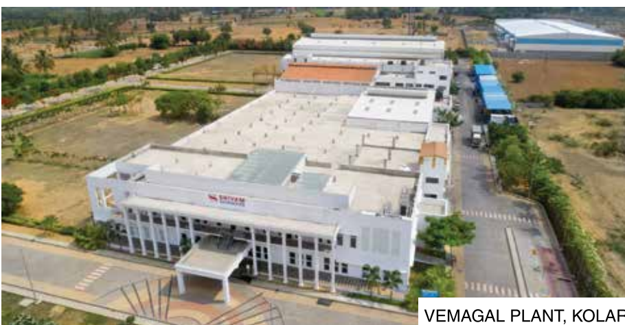
VEMAGAL PLANT, KOLAR