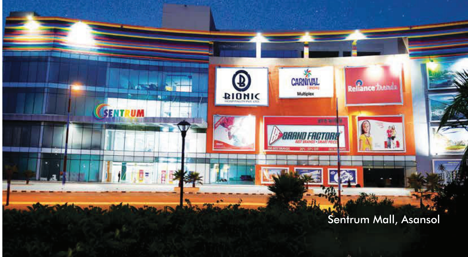
Sentrum Mall, Asansol

Shristi has embarked upon retail and commercial projects like Shopping Malls, Commercial and Leisure Complexes mostly within its own townships, to enhance urban lifestyles.