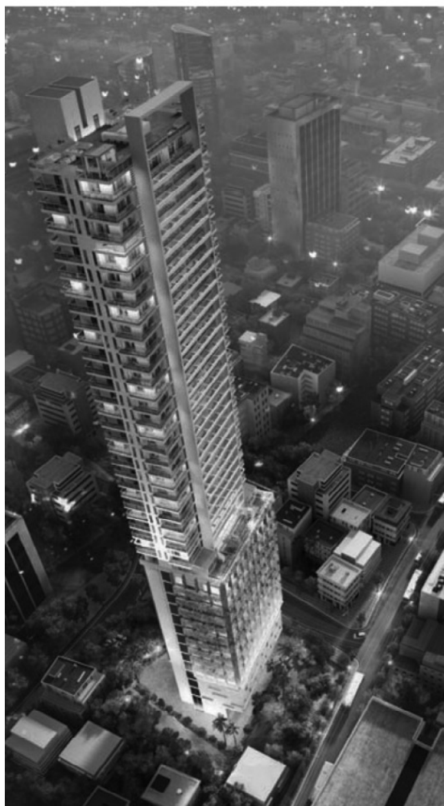
Shristi Sea View, Mumbai, Maharashtra