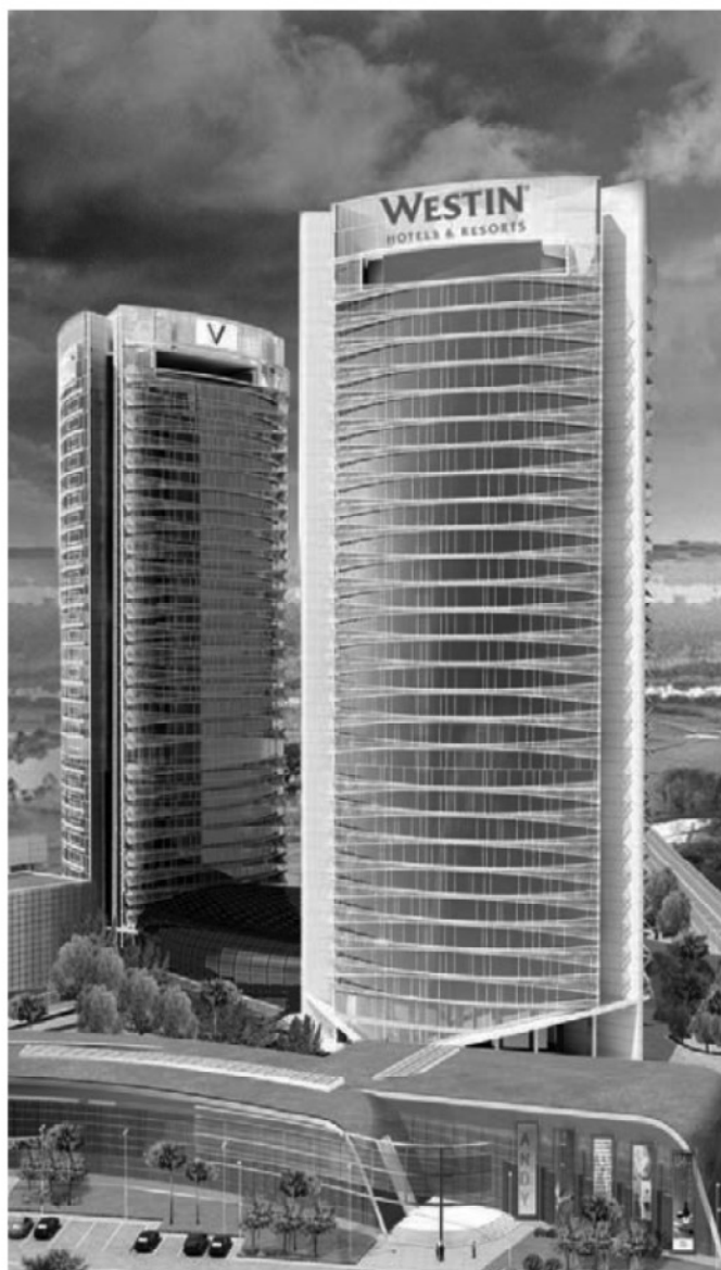
Westin Hotel and The V, Kolkata, West Bengal