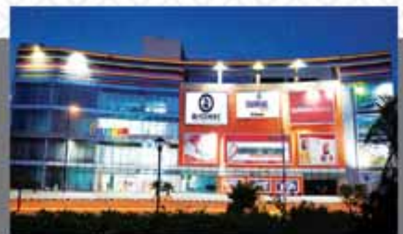
Sentrum Shopping Mall