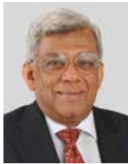
Deepak S Parekh Chairman