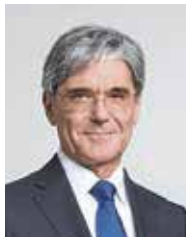
Joe Kaeser Director