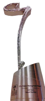
CNBC Asia's 'India Business Leader Award' for Talent Management.