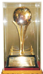
Maharashtra Chamber of Commerce, Industries and Agriculture's R J Rathi Award for efforts in environmental pollution control.