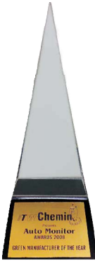
Auto Monitor Award for the 'Green Manufacturer of the year'