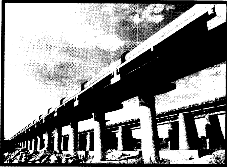
VIEW OF PIPELINE OVER BRIDGE OF T.K.HALLY PROJECT FOR BANGALORE WATER SUPPLY & SEWERAGE BOARD