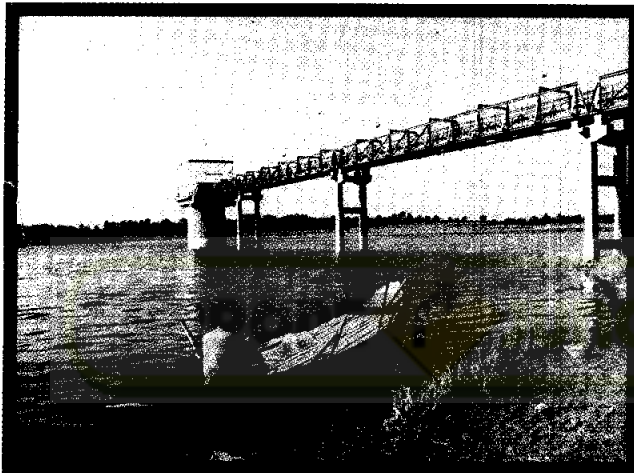
VIEW OF INTAKE WELL & BRIDGE OF RAGHUNATHPUR WATER TREATMENT PLANT FOR PUBLIC HEALTH ENGINEERING DEPT. OF WEST EBGAL