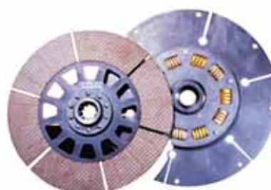
Oil Spray Disk/ Isolators