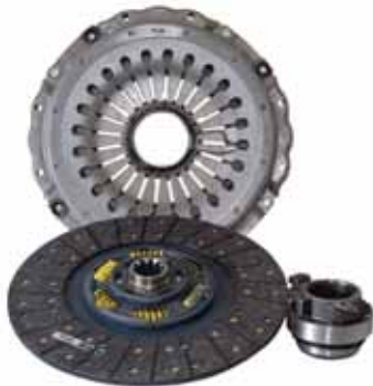
362mm Single Diaphragm Spring, Push Type Clutch with Organic Driven Plate