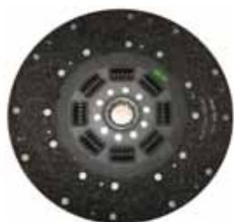
380 Organic Driven Plate