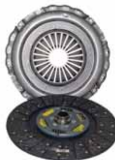
395mm Single Push Type Clutch with Organic Driven Plate