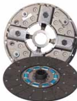
16.5"/420mm Single Direct Pressure Coil Spring, Push Type Clutch with Organic Driven Plate