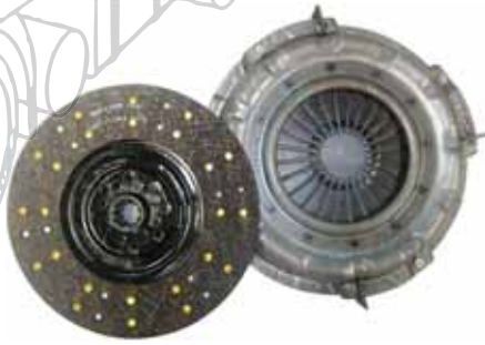
12"/310mm Single Diaphragm Spring, Push Type Clutch with Organic Driven Plate