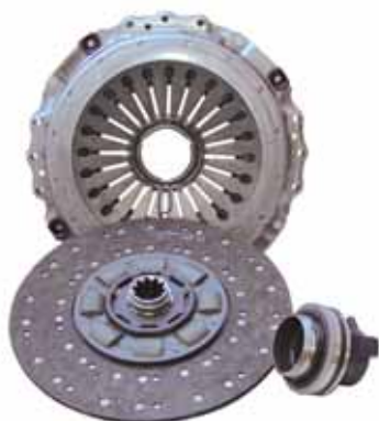
17"/430mm Single Diaphragm Spring, Pull Type Clutch with Organic Driven Plate