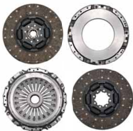
400mm Twin Diaphragm Spring, Pull Type Clutch with Twin Organic Driven Plate