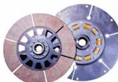
Oil Spray Disk/ Isolators