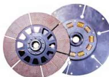
Oil Spray Disk/ Isolators