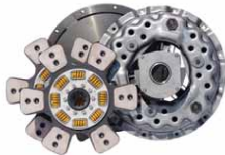
14"/ 352mm Single & Twin Press Steel Cover, Direct Pressure Coil Spring, Pull Type Clutch with Ceramic Driven Plate