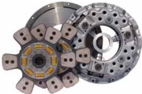
14"/ 352mm, Single & Twin Press Steel Cover, Direct Pressure Coil Spring, Push Type Clutch with Ceramic and Organic Driven Plate