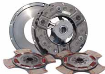
15"/ 380mm Single & Twin Direct Pressure Coil Spring, Push and Pull Type Clutch with Ceramic and Organic Driven Plate