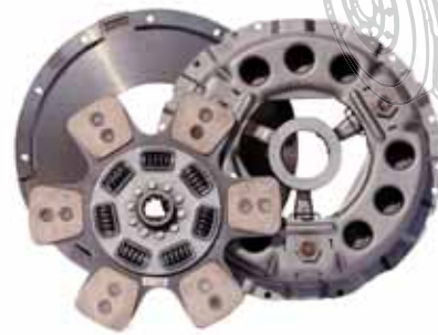
13"/ 330mm Single Push Type Clutch with Ceramic and Organic Driven Plate