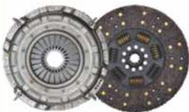
310mm Single Diaphragm Spring