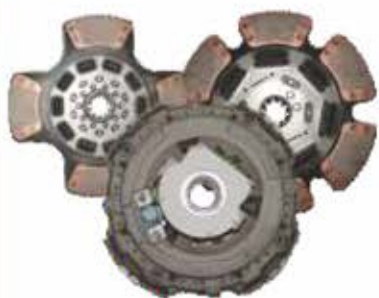
15.5 inch Angular Spring Twin Clutch