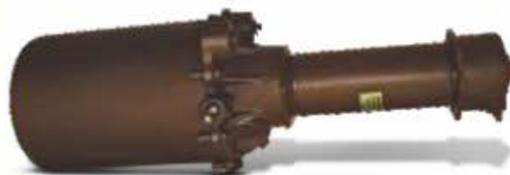
Hydraulics Pressure Converter