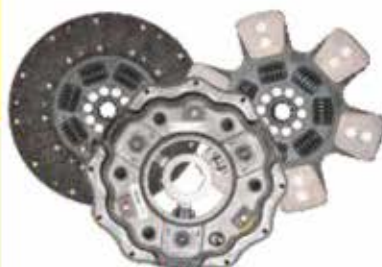
330mm Single Direct Pressure Coil Spring