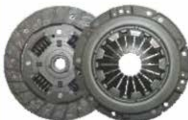
170mm Single Diaphragm Spring