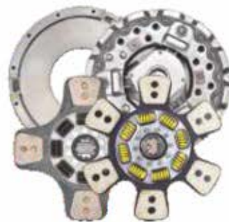
352mm Single & Twin Direct Pressure Coil Spring