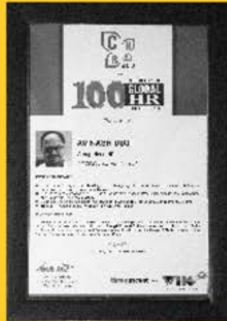
100 Most Influential Global HR Professionals