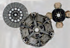
280 Dia Clutch Set Double 4P