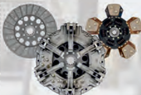
280 Dia Clutch Set Dual 5P