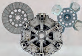
280 Dia Dual-Rigid 4P