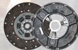
15"/380mm Single Push Coil Spring