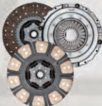
395mm Single Push Diaphragm Spring