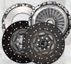
400mm Twin Diaphragm Spring