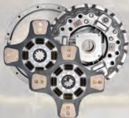
14"/352mm Single & Twin Direct Pressure Coil Spring