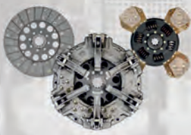
280 Dia Clutch Set Dual 4P