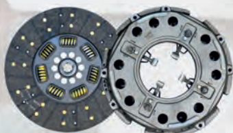
310 Dia Clutch Set Organic Single