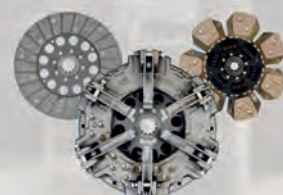
280 Dia Clutch Set Dual 7P