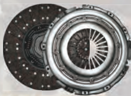
362mm Single Diaphragm Spring