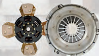
280 Dia Clutch Set Ceramic Single