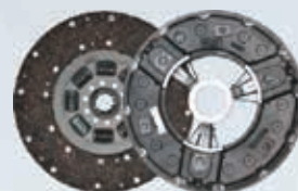
15"/380mm Single Push Coil Spring