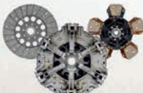
280 Dia Clutch Set Dual 5P