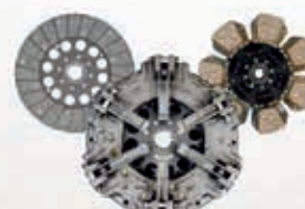
280 Dia Clutch Set Dual 7P