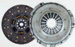
280 Dia Single Diaphragm Clutch