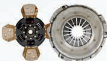
280 Dia Clutch Set Ceramic Single