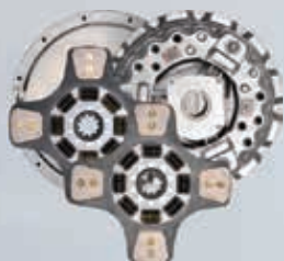
14"/352mm Single & Twin Direct Pressure Coil Spring