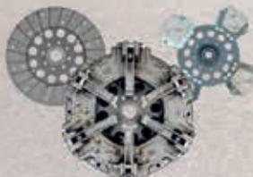
280 Dia Dual-Rigid 4P