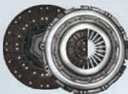
362mm Single Diaphragm Spring