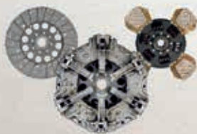
280 Dia Clutch Set Dual 4P