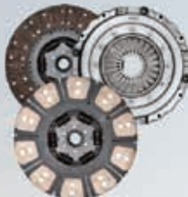
395mm Single Push Diaphragm Spring