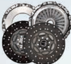
400mm Twin Diaphragm Spring