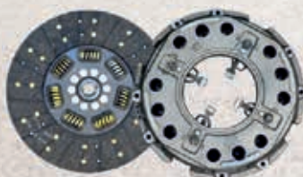
310 Dia Clutch Set Organic Single