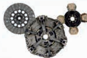
280 Dia Clutch Set Double 4P