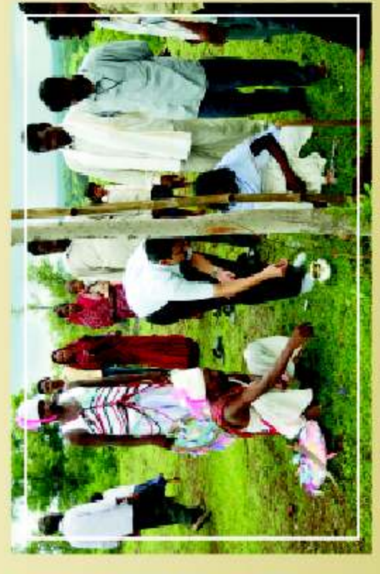
Bhoomi Puja for periphery development activity at Kandeimunda village