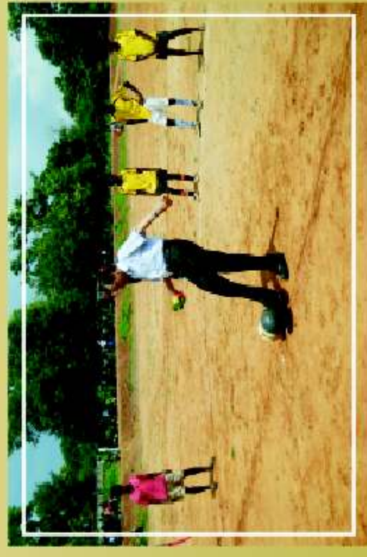
Inaugurating Foot ball match for youth at Kutra High school