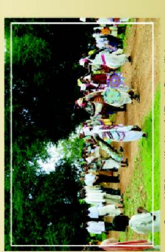
Ceremonial Welcome at Kandelmunda Village to Director Works