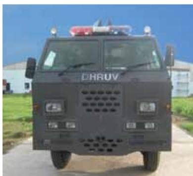
Dhruv - ATC