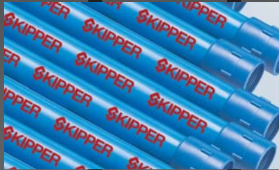
PVC Pipes & Fittings