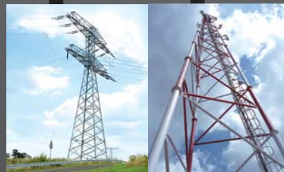
Transmission & Telecom Towers