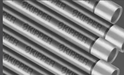
ERW Steel Pipes