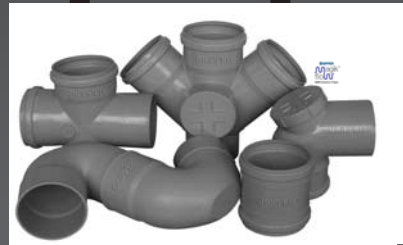
SWR Pipes & Fittings