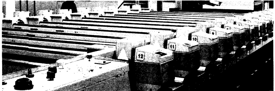
Rotary Printing Machine for Textile

Technology and Market Leadership in Rotary Screen and Printing Machinery