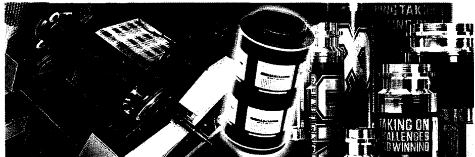
Anilox and Screens for Graphic Printing