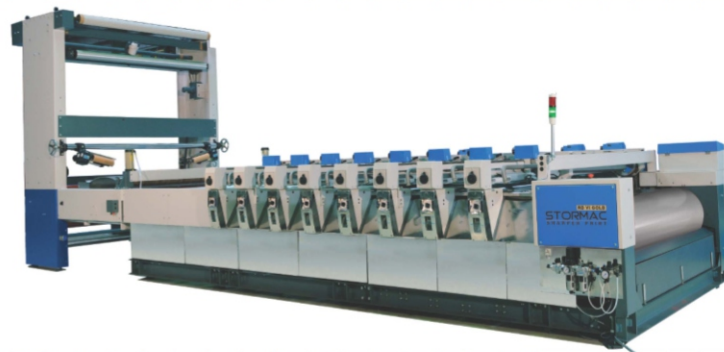
▲ Rotary Screen Printing Machine - STORMAC RDVI Gold