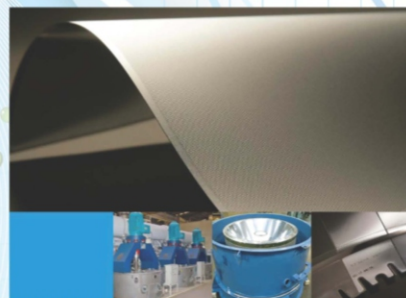
▲ Sugar Screens