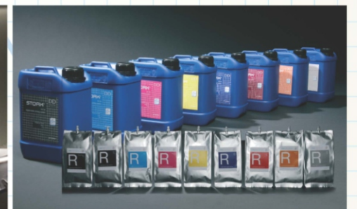
▲ Digital Textile Printing Ink