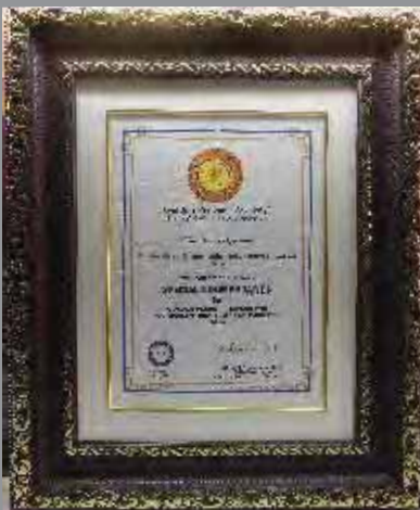
Golden Peacock Award