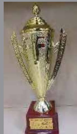
Dream Companies to work for