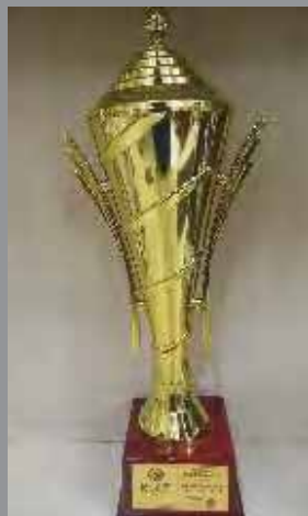
Global HR Excellence Awards