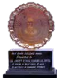
Gold Star Award from National Institute of Economic Development, New Delhi.