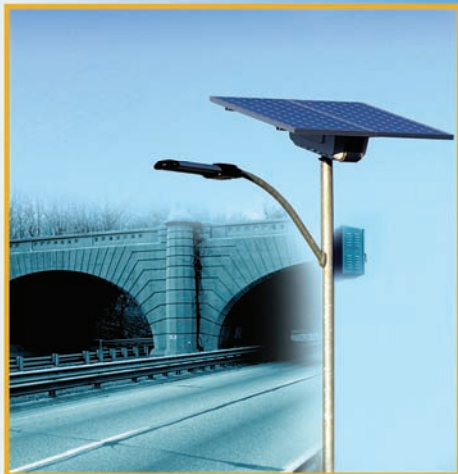
Solar Street Light