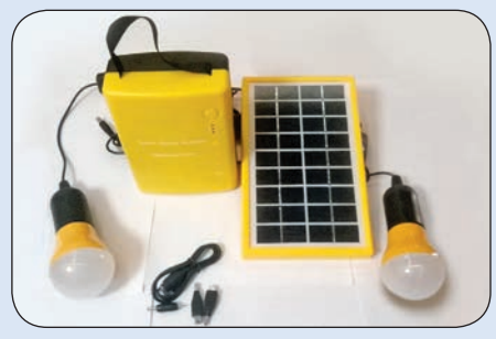
EMERGENCY HOME POWER PACK