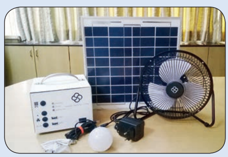
SOLAR MINI HOME POWER SYSTEM