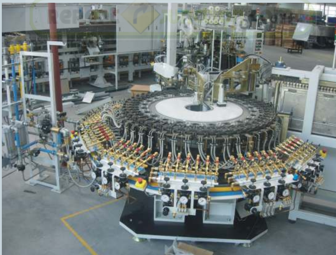
State-of-the-art CFL Chain (From GE Hungary)