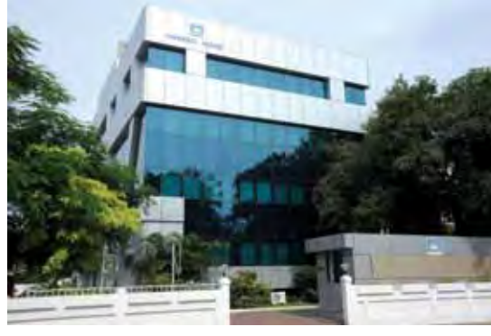
Registered and Corporate Office, Chennai