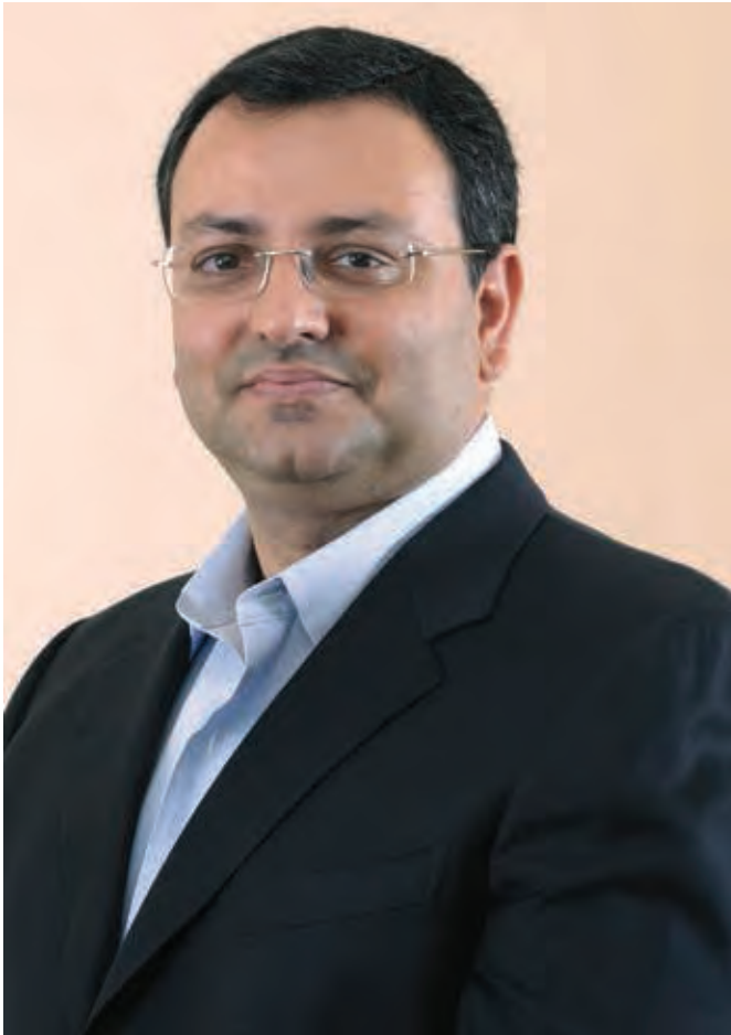
CYRUS P MISTRY CHAIRMAN

Tata Motors is privileged to have a strong parent brand, a rich commercial vehicle pedigree, international design centres of global standards, and last but not the least, committed employees and a strong dealer and vendor base.