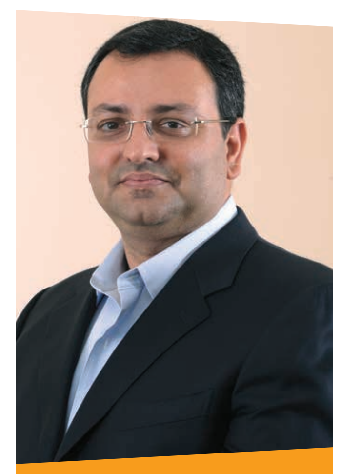
CYRUS P MISTRY

The global auto industry recorded a surge in sales with impressive growth, riding on the back of strong demand in the world's top two automobile markets – China and the United States. The automotive industry in the US came back to strength from the poor period of recession, supported by low interest rates and improving consumer sentiment. Sales in China- the world's largest auto market since 2009- also crossed the 20 million cars mark. Pressure on local carmakers built up, as foreign automakers stepped up their investments in China. Europe did show some early signs of recovery, but with high levels of unemployment continuing to prevail in southern Europe, a clear turnaround was not visible. Consumer behavior in that region remains cautious.