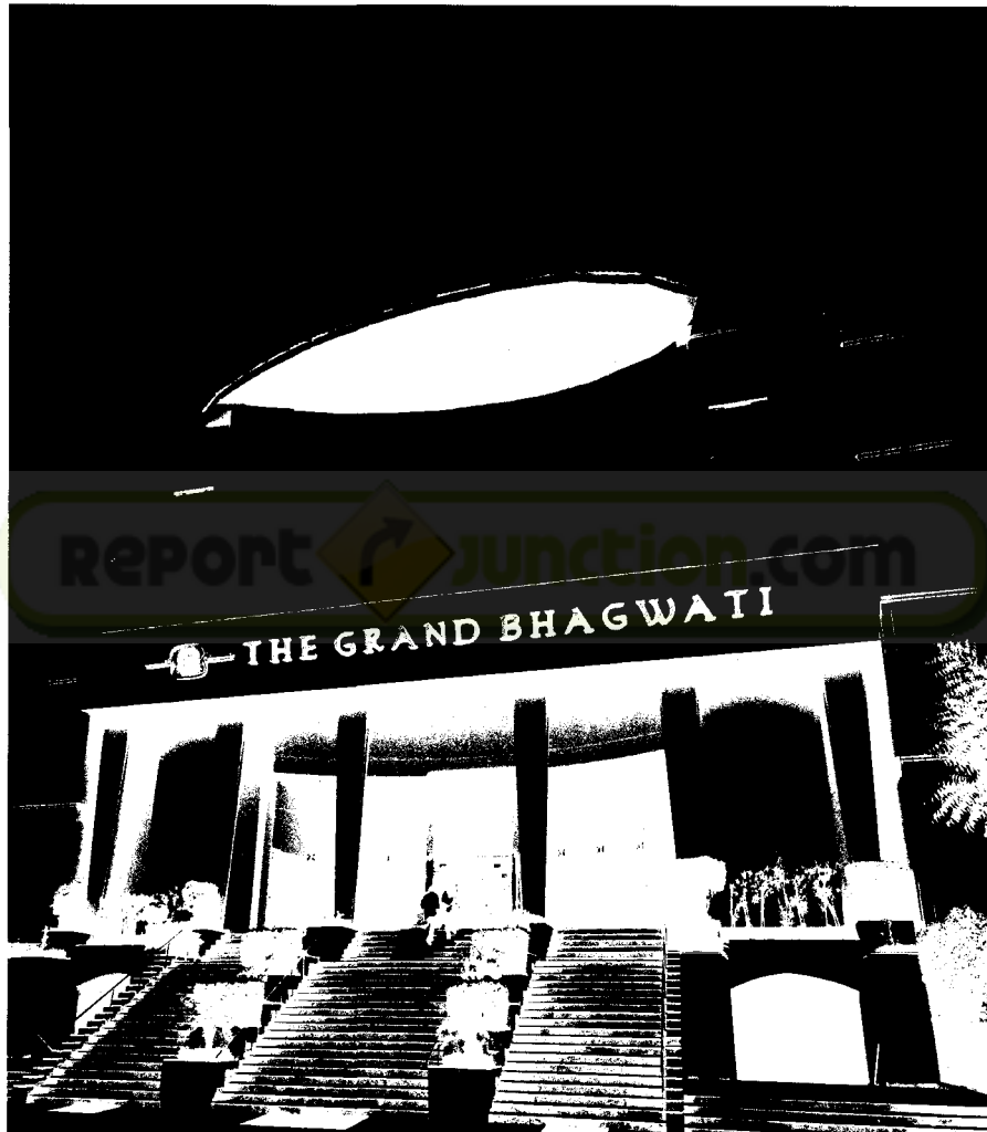
The Grand Bhagwati's four-star hotel in Ahmedabad.