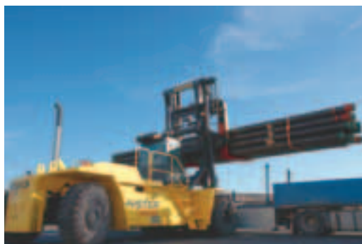
Big Forklift Trucks