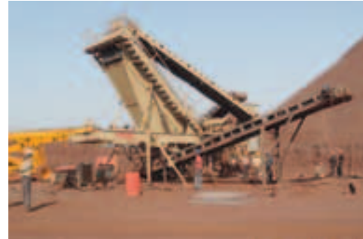
High Frequency Screens