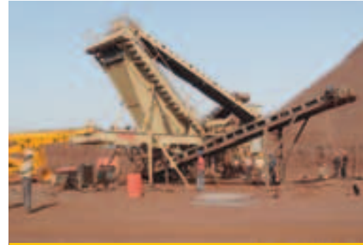
High Frequency Screens