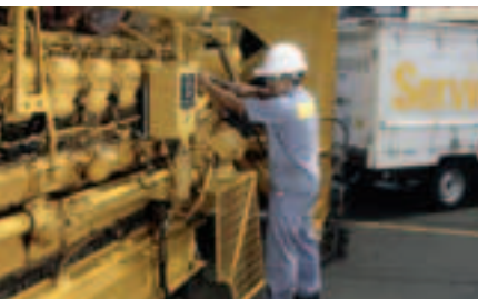
24x7 Field Service Management