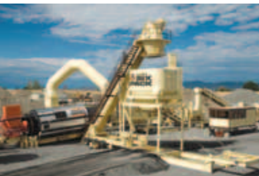
Hot Mix Double Barrel Asphalt Plants