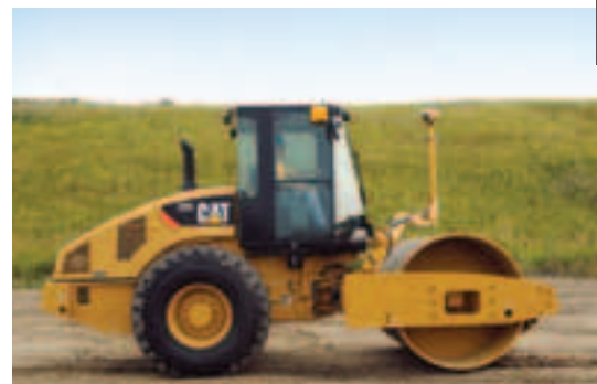
Vibratory Soil Compactors