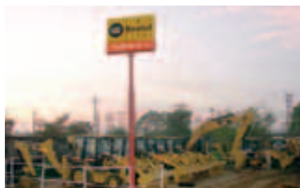
Rental & Used Equipment Solutions