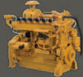
G 3306 Gas Engines