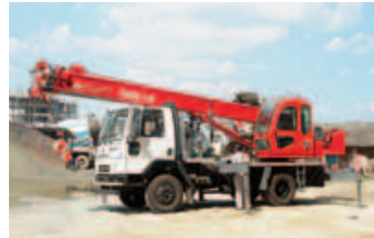
Truck Mounted Cranes