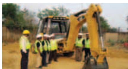
Maintenance and Operator Training for Customers