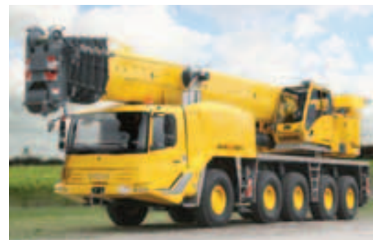
All Terrain Cranes