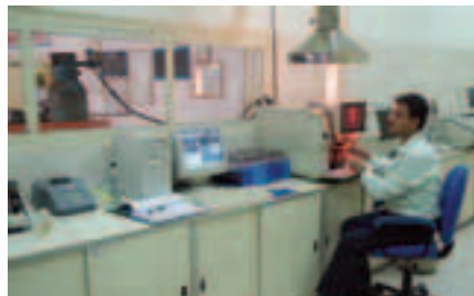
Scheduled Oil Sampling (S•O•S SM ) Services