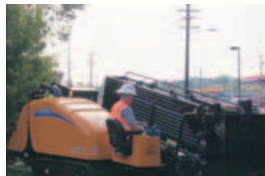
Horizontal Directional Drills