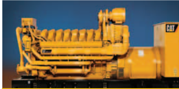
C175 Diesel Generator Sets