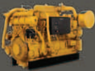
C9 ACERT Engines