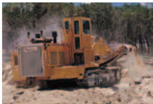
Mechanical Drive Chain Trenchers