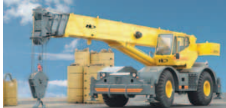
Rough Terrain Cranes