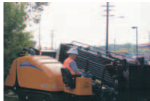
Horizontal Directional Drills