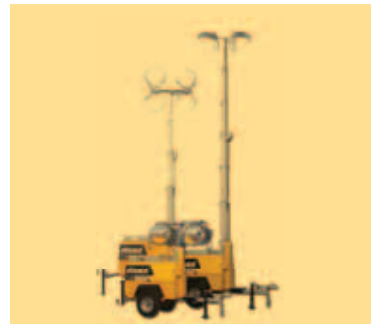
Allmand Lighting Towers