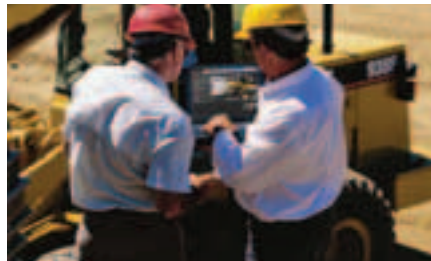
Equipment Investment Analysis