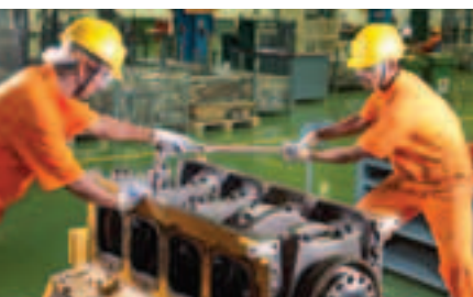
Component Repair & Complete Machine Rebuilds