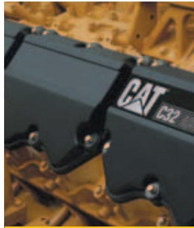
C32 ACERT Diesel Engines