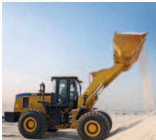
SEM Wheel Loaders