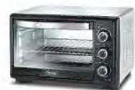
Oven Toaster Grills

Jo apnon se kare pyaar, woh Prestige se kaise kare inkaar.