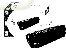
TVS-E Laser Toner Cartridges