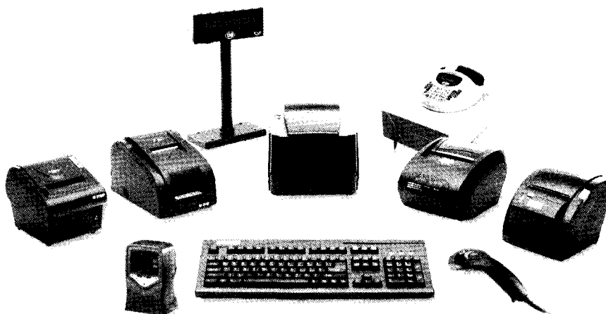
TVS POS Products