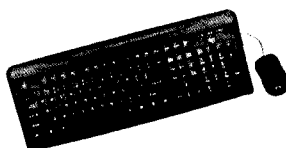
TVS Champ Plus