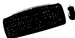
TVS Champ Media Plus