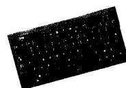
TVS Champ Junior