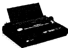
MSP 250 Champion