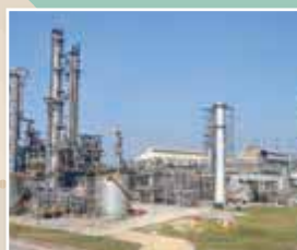
Babrala Fertiliser Plant