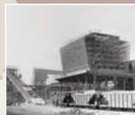
Construction of Cooling Towers