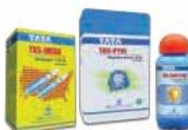
TKS Crop protection