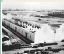
Aerial view of Warehouse (Central Maintenance Shop)