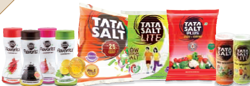
Tata Salt and Flavoritz