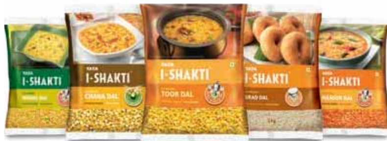
i-Shakti pulses, cooking soda and besan