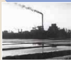
Plant view from Salt Works