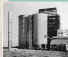
RCC Silos Soda Ash storage