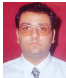
MR. CYRUS PALLONJI MISTRY