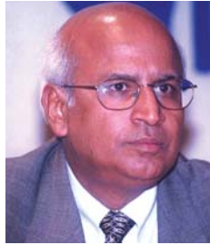
MR. S RAMADORAI