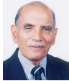
DR. F C KOHLI