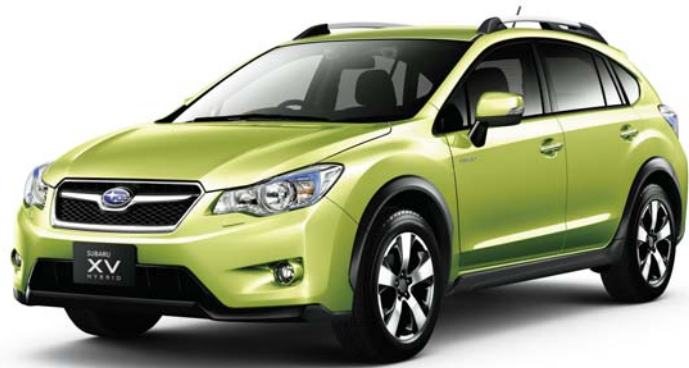
Design and development of complete Electric Control Unit (ECU) for a hybrid vehicle

We address product engineering for the Broadcast, Consumer Electronics, Medical Electronics, Telecom and Transportation industries.