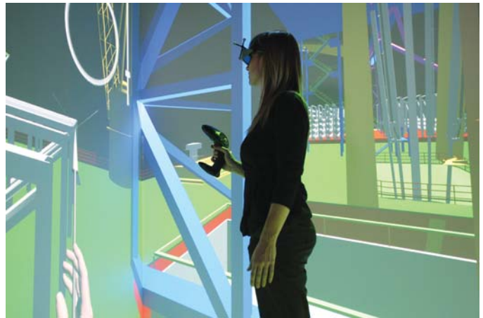
Integration of Virtual Reality systems for R&D and manufacturing