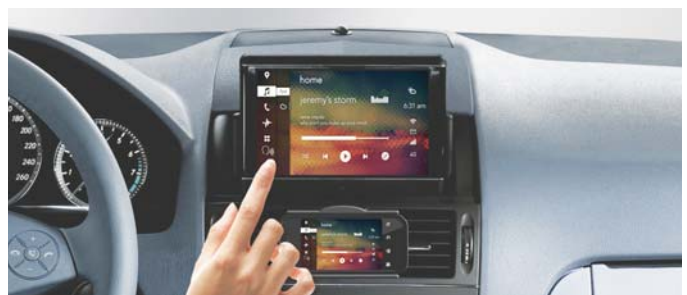
Intuitive concept user experience for cars - The AGL "Best User Experience" award winner