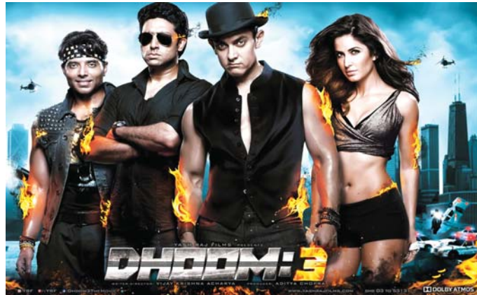
Winner of the 59th Filmfare Award "Best Visual Effects" and winner of the "Best Visual Effects" at the Star Guild Awards 2014

We have won the coveted 59th Filmfare Award and the Star Guild Award 2014 for "Best Visual Effects for a Feature Film" for our work in Dhoom 3 and have been acclaimed for the stellar work in delivering visual effects for Bhaag Milkha Bhaag.