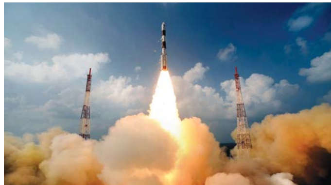
Development of a Data Control Hardware for Vikram Sarabhai Space Centre (VSSC) for India's first ever Mission to Mars