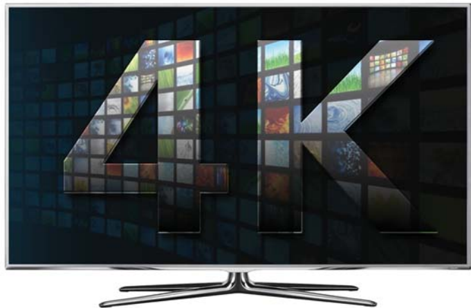
Ultra High Definition (UHD) Decoder for next-gen content delivery