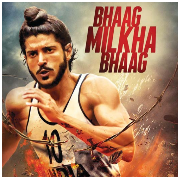
Rekindling the magic of old times in 'Bhaag Milkha Bhaag'