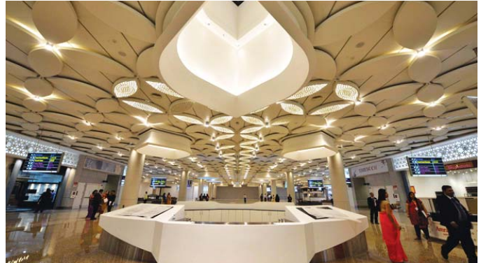
Creating a unique passenger experience at Mumbai's new integrated T2

We have supported the launch of multiple brands and products across the world. We have won several international awards and patents for design and innovation.