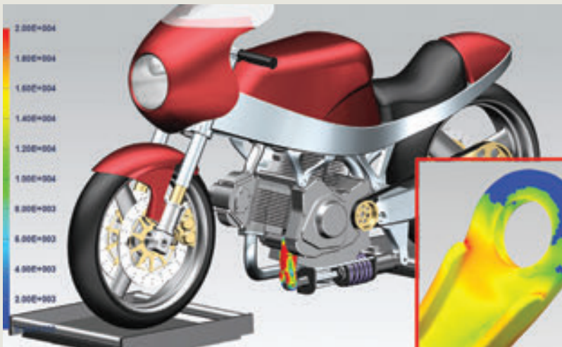
CAD/CAM/CAE solutions for various industries

We also provide Professional Services, maintenance and support services for data mining, storage, IT facilities and network management in India and overseas.