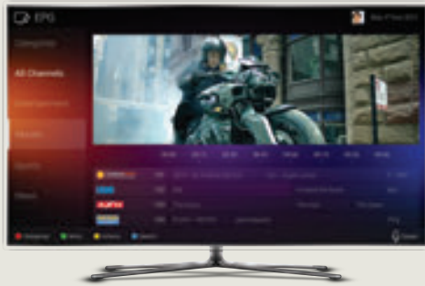
Feature rich applications and UI for Broadcast and TV

We provide technology consulting, product development and testing services for leading product companies, service providers and start-ups. This is backed by an in-depth understanding of technology, a large multi-disciplinary product development team, mature processes and systems.