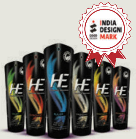
Packaging design and branding for HE Deodorant