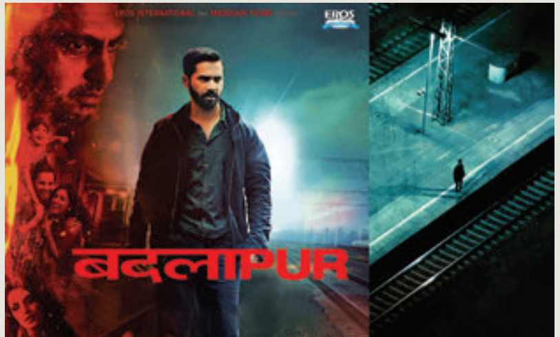
Creating magical moments for feature films

We also support advertising and marketing by providing these services for TV commercials and corporate videos for visualization and new product launches.