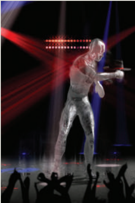
Stunning visual effects for promotional events and marketing

We provide animation and visual effects (VFX) services for feature films and episodic television.