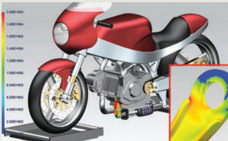
CAD/CAM/CAE solutions for various industries

We also provide Professional Services, maintenance and support services for data mining, storage, IT facilities and network management in India and overseas.