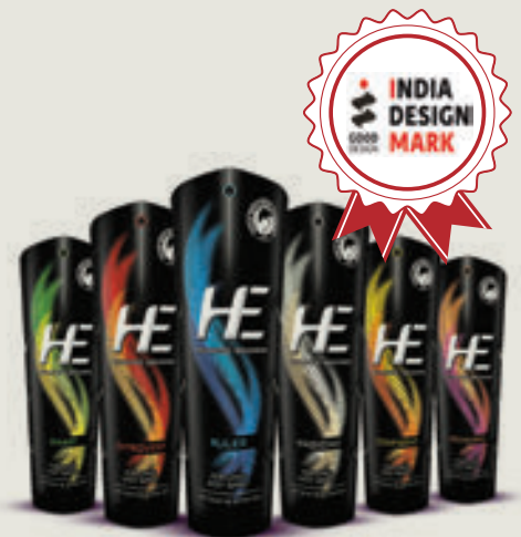
Packaging design and branding for HE Deodorant