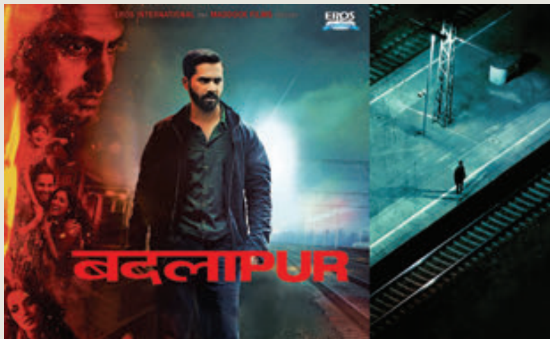
Creating magical moments for feature films

We also support advertising and marketing by providing these services for TV commercials and corporate videos for visualization and new product launches.