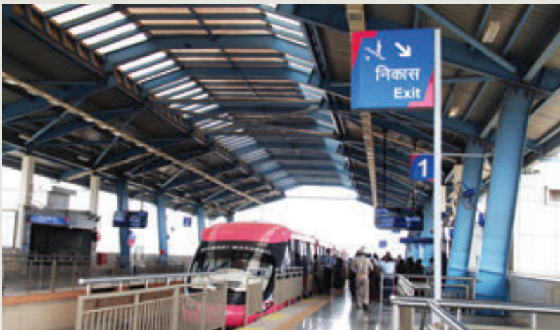
Signage system for Mumbai Monorail

We have supported the launch of multiple brands and products across the world, winning various international awards and patents for design and innovation.