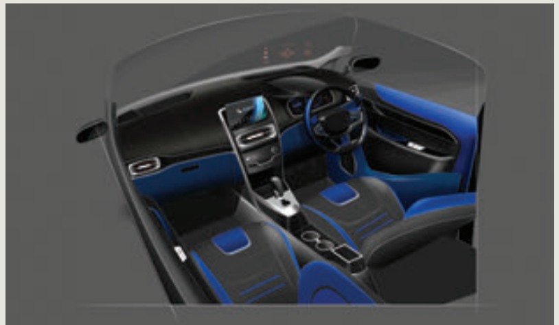
Next-generation Automotive electronics and software development

We also create and license intellectual property and software components; helping customers create product differentiation and reduce development costs and time-to-market.