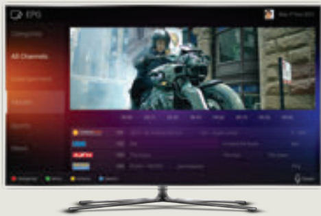
Feature rich applications and UI for Broadcast and TV

We provide technology consulting, product development and testing services for leading product companies, service providers and start-ups. This is backed by an in-depth understanding of technology, a large multi-disciplinary product development team, mature processes and systems.