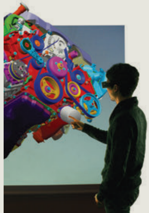
Integration of Virtual Reality systems for R&D and manufacturing