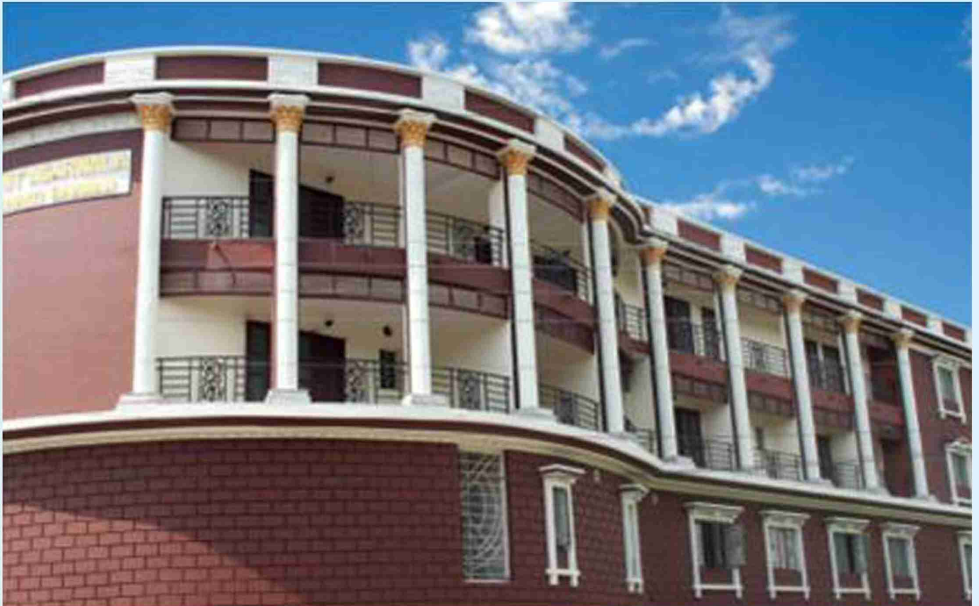
Amit Agarwala Banga Bhawan, Siliguri