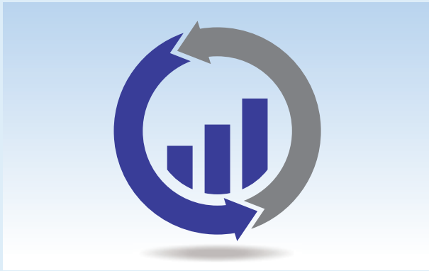
Growth and Value Cycle