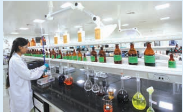
Quality Control Lab