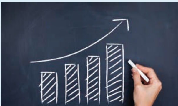
Focus on Long Term Financial Health

We maintain the highest level of transparency, accountability and equality in all aspects of the operations and in all interactions with our stakeholders as part of our commitment to practice sound corporate governance principles.