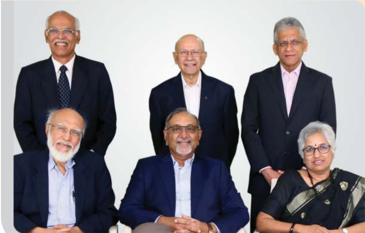
(L) to (R)