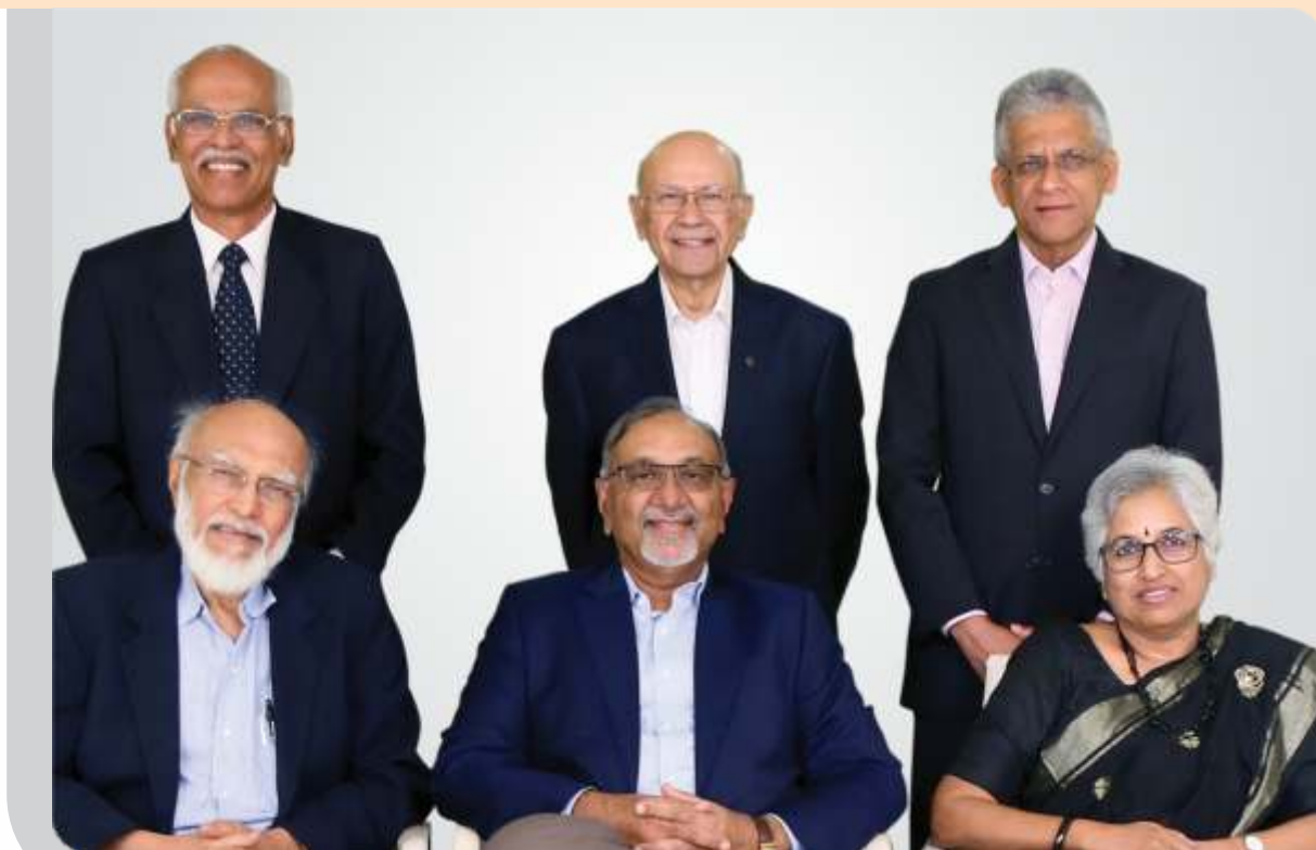
(L) to (R)