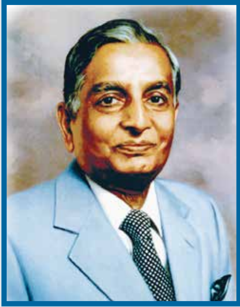
Syt. Madhav Prasadji Birla (1918-1990)