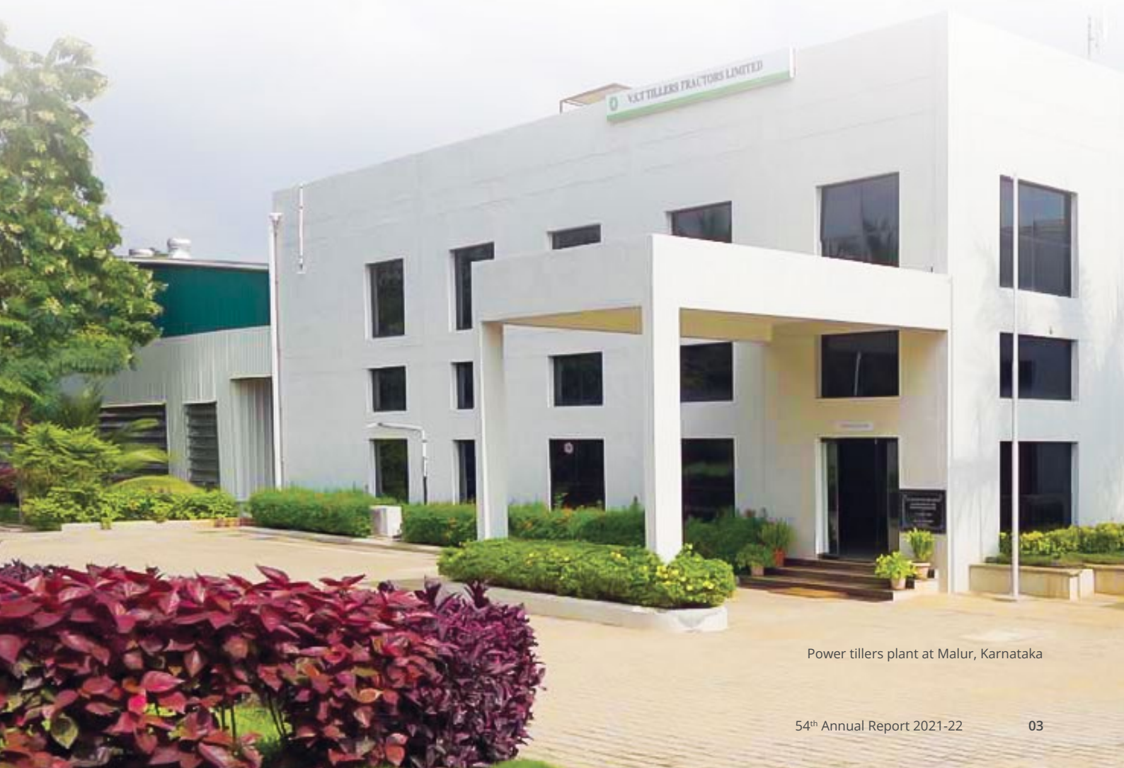
Power tillers plant at Malur, Karnataka

Market share in Compact Tractors segment in India