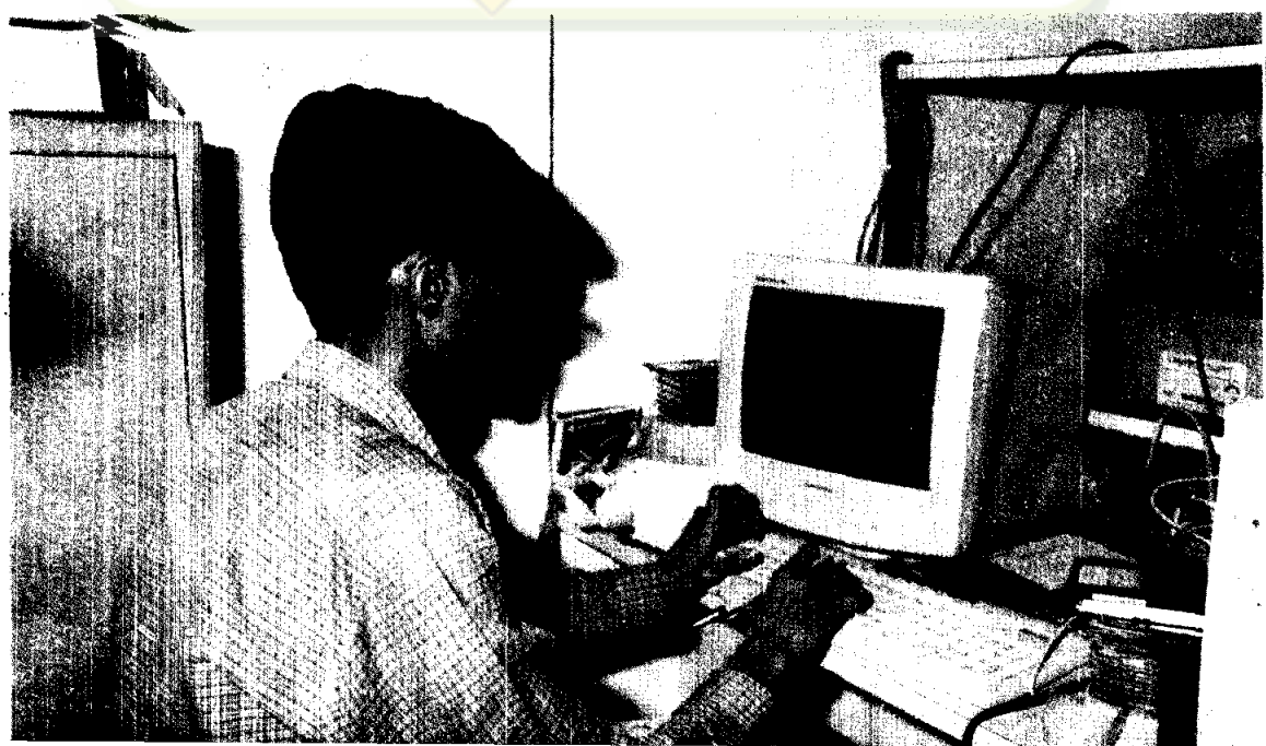
View of CD Preparation Centre