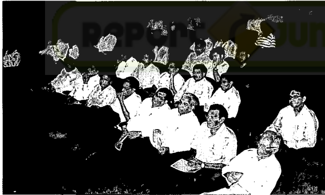
▲ Shareholders at Annual General Meeting

The Board of Directors have recommended dividend of Rs. 3.75/- per share of face value Rs 10 i.e. 37.50% increased from Rs 2/- per share i.e. 20% paid in the previous year. The Board of Directors have recorded their sincere thanks to the Shareholders and other stakeholders for their continuous support to the Company.