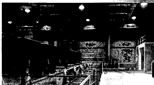
◀ Kolkata plant expansion in progress