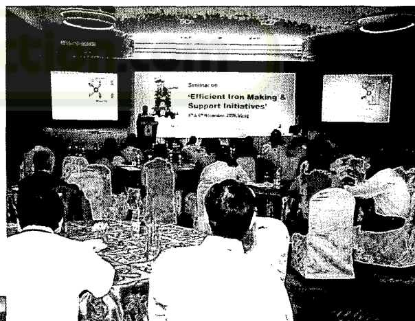
Customer Meet at Visakhapatnam

This year saw a renewal of relationships with customers through several customer awareness programs. The highlight was the seminar on "Efficient Iron Making & Support Initiatives" conducted at Visakhapatnam which attracted over 100 participants from the iron making fraternity who were enlightened by the discourses from eminent speakers from Essar Steel, JSPL, JSW Steel, Siemens VAI of UK, Tata Steel and Vesuvius Group. This seminar made customers, OEMs and engineering consultants aware of relevant best practices worldwide.